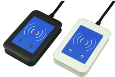
Desktop version (inlay customizable)

The T4 MultiTech 2 LF reader/writer allows users to read and write to almost any 125 kHz and 134.2 kHz tags and/or labels. It supports all major transponder technologies like HID, HITAG, Nexwatch, KERI, Cotag, CASI-RUSCO etc.